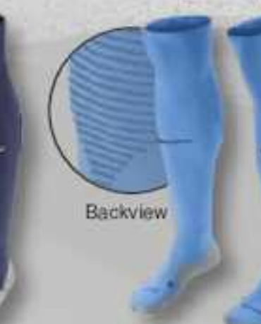
412 University Blue/ Italy Blue/ (Midnight Navy)