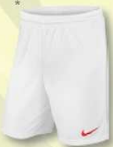
102 (Men's only) White/ (University Red)