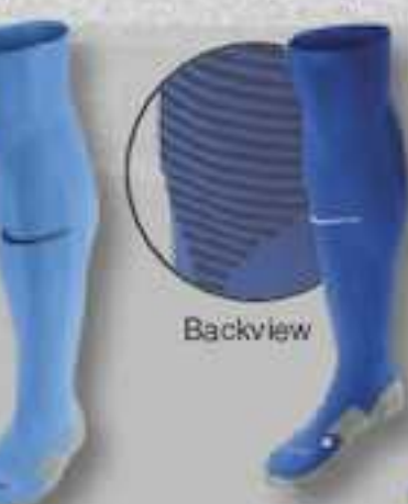
463 Royal Blue/ Midnight Navy/ (White)