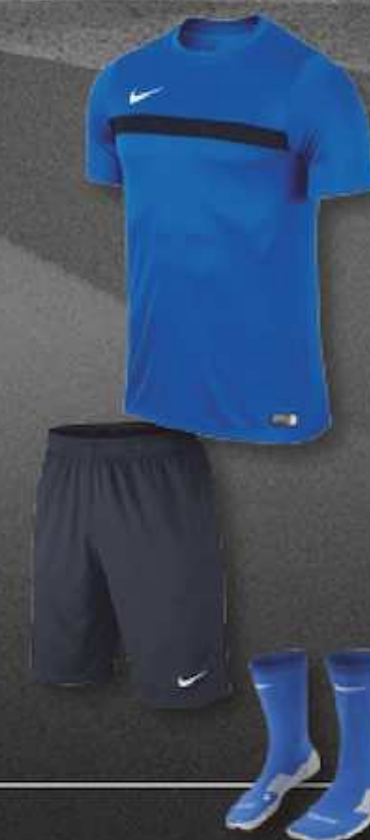
TEAM MATCHFIT CORE CREW SOCK p.57