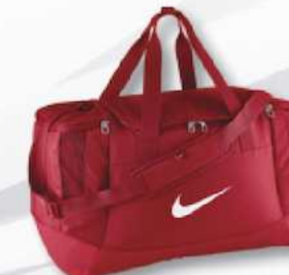
657 University Red/University Red/(White)