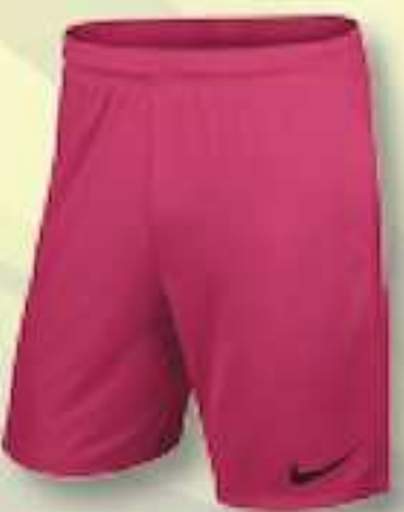
616 Vivid Pink/ (Black)