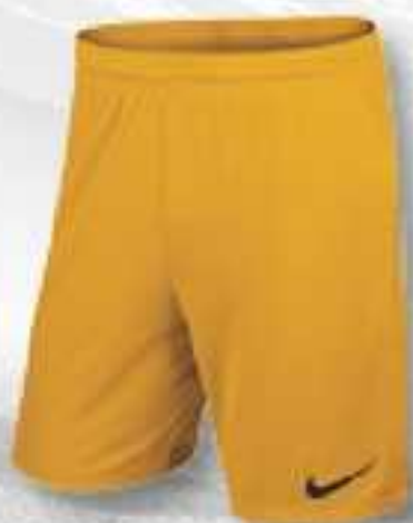
739 University Gold/ (Black)