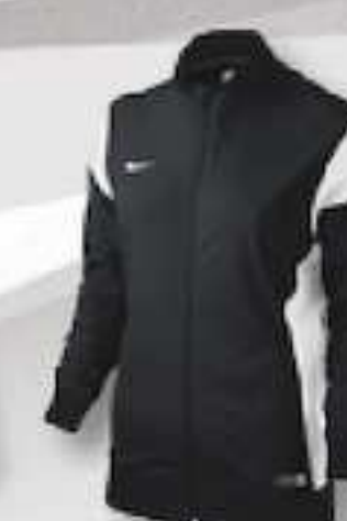
010 Black/White/ (White)