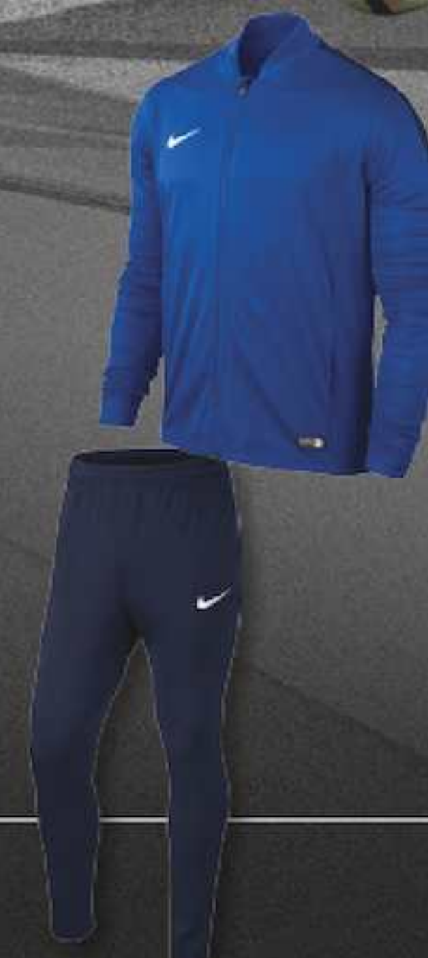
KNIT TRACKSUIT p.47