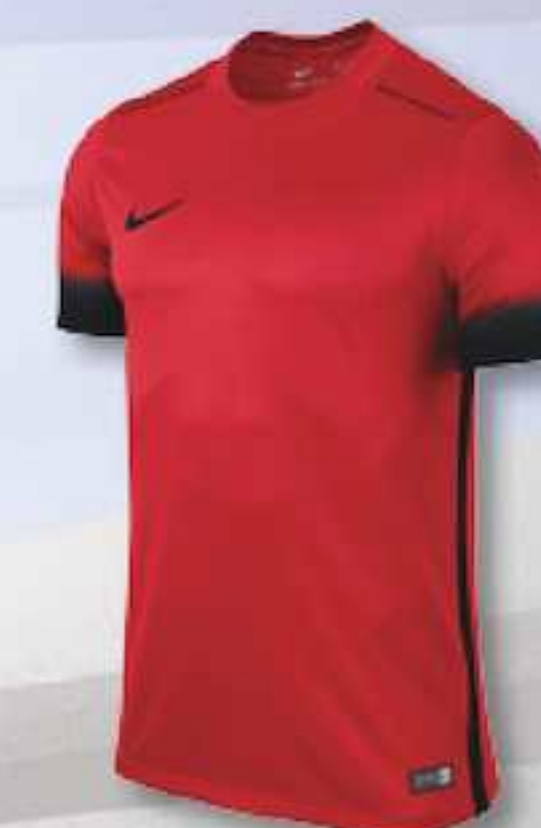
657 University Red/Black/ (Black)