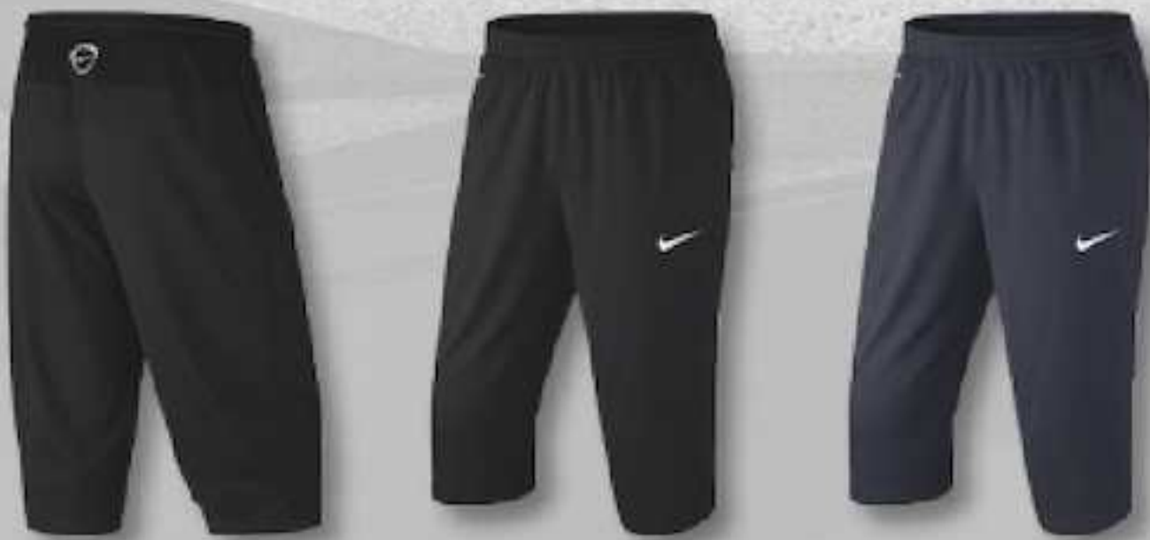
010 Backview 010 Black/(White) 451 Obsidian/(White)