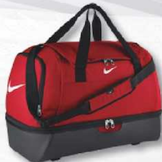
657 University Red/Black/(White)