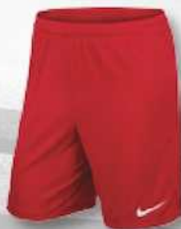
657 University Red/ (White)