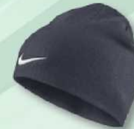
451 Obsidian/ (Football White)