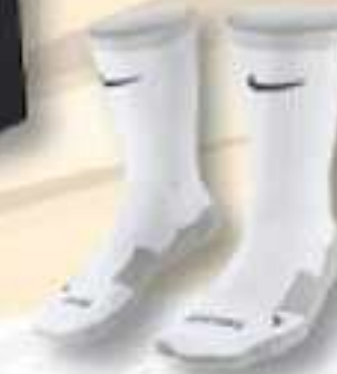
TEAM MATCHFIT CORE CREW SOCK p.57