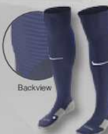
410 Midnight Navy/ Game Royal/ (White)