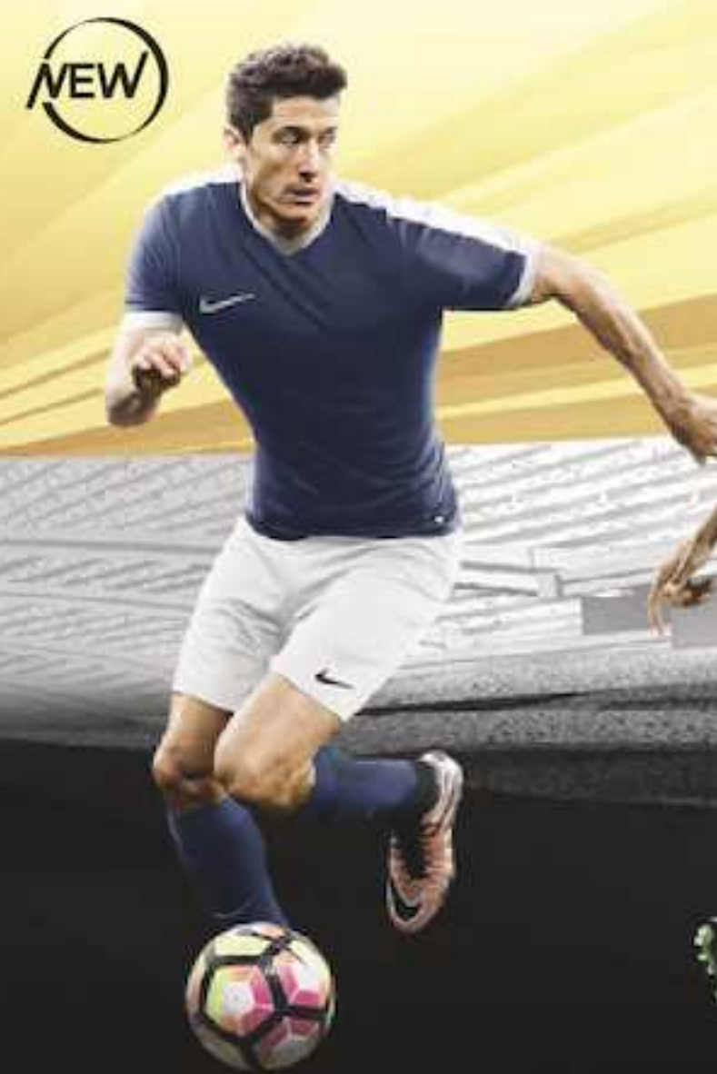
STRIKER IV JERSEY