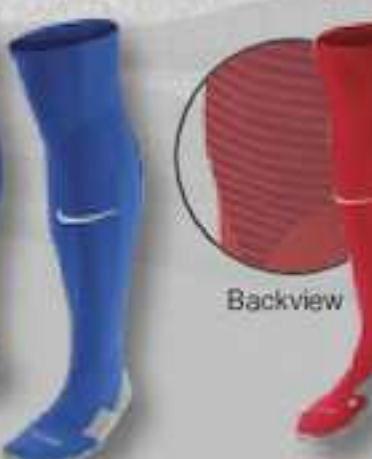
657 University Red/ Gym Red/ (White)