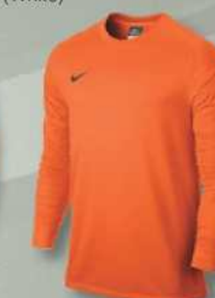
803 Total Orange/(Black)