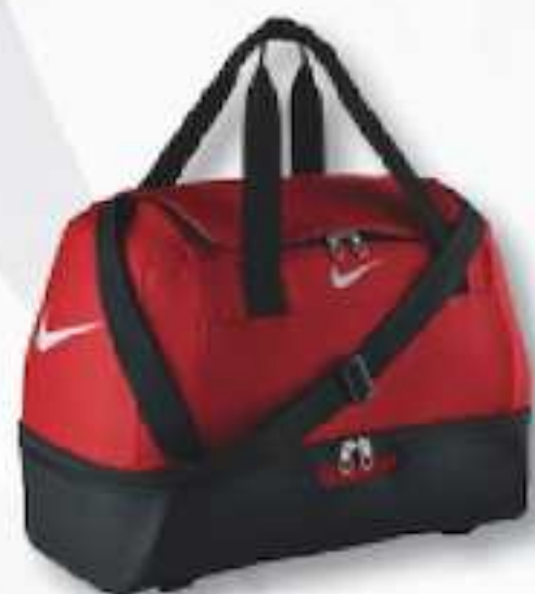
657 University Red/Black/(White)