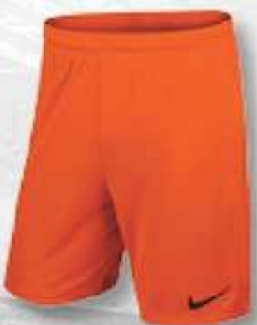
815 Safety Orange/ (Black)