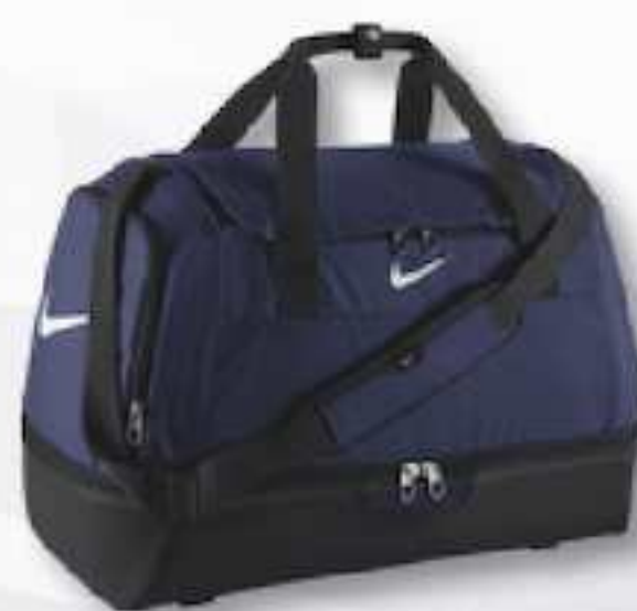
410 Midnight Navy/Black/(White)