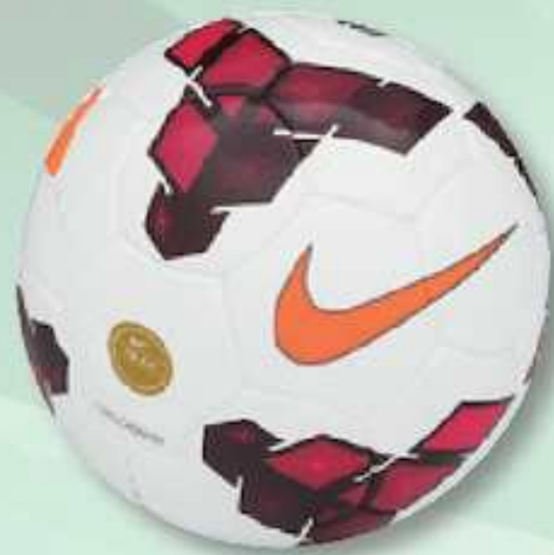
167 White/Red/ (Total Orange)