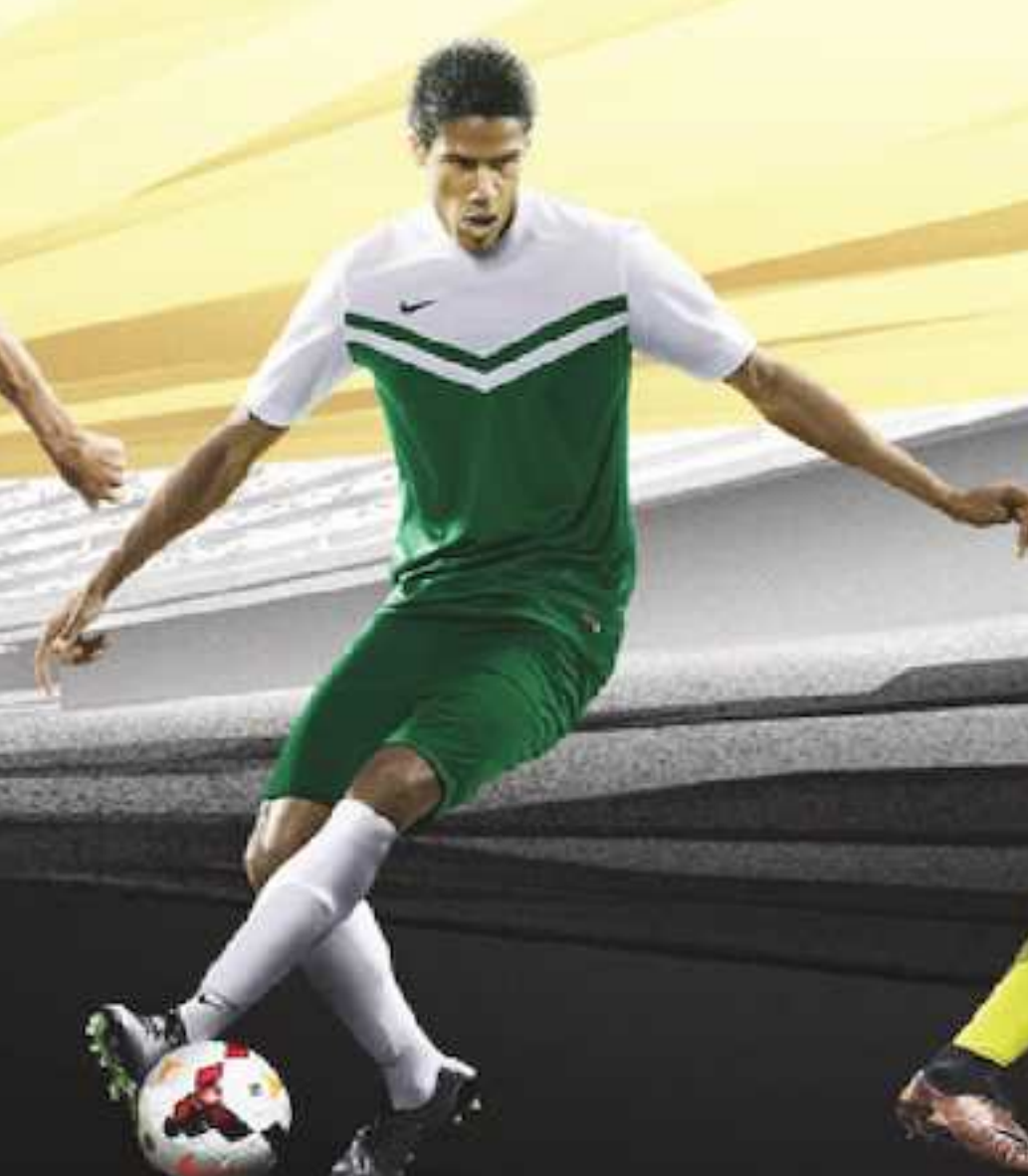
VICTORY II JERSEY