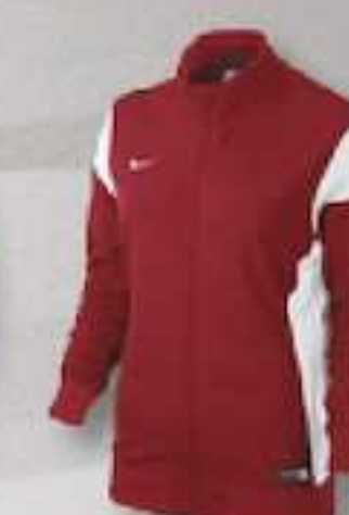
657 University Red/White/ (White)

Sweat management on and off of the pitch.