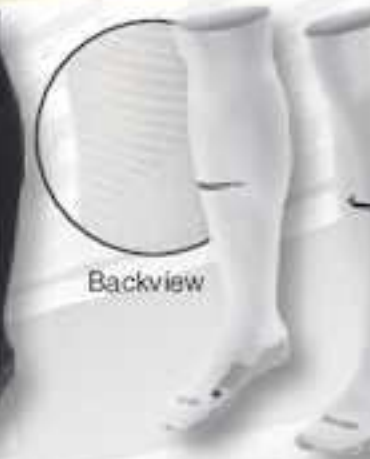
100 White/ Jetstream/ (Black)