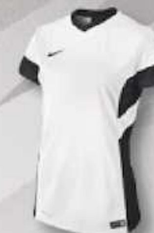
100 White/Black/ (Black)