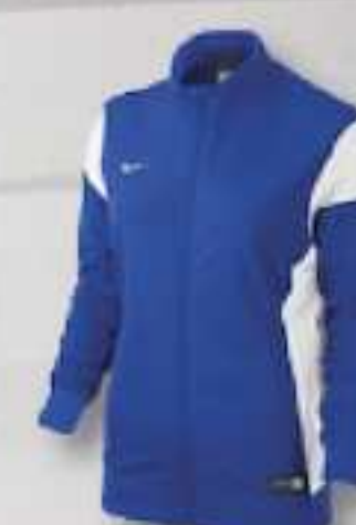
463 Royal Blue/ White/(White)