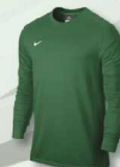
302 Pine Green/(White)