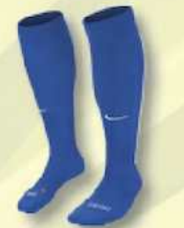
463 Royal Blue/Football White/(Football White)