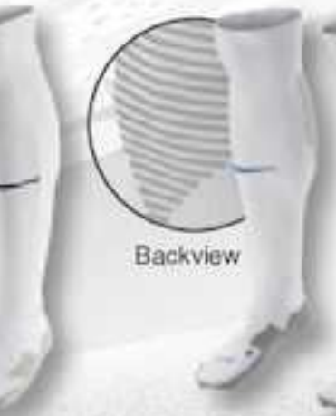
101 White/ Jetstream/ (Royal Blue)