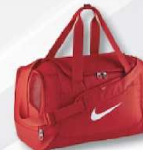
657 University Red/University Red/(White)