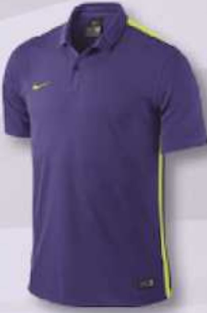
547 Court Purple/Volt/ (Volt)