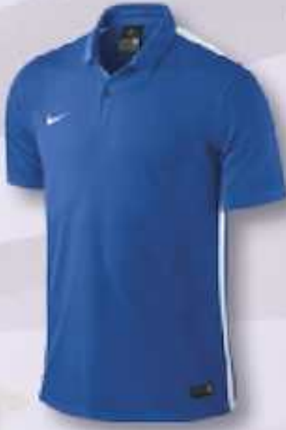
463 Royal Blue/Football White/ (Football White)