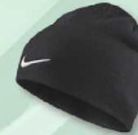
010 Black/ (Football White)