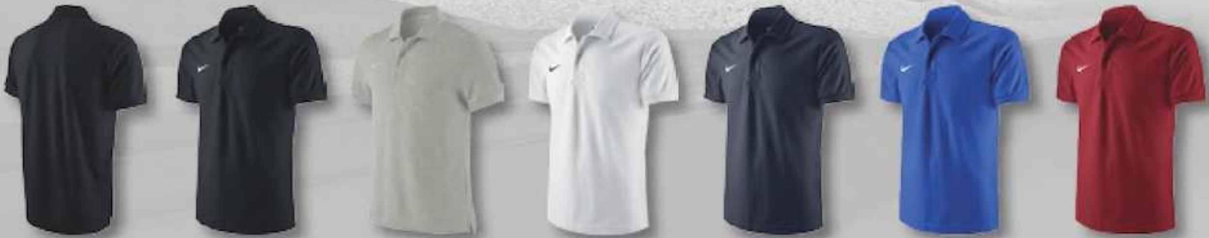
010 Backview 010 Black/(White) 050 Grey Heather/(White) 100 White/(Black) 451 Obsidian/(White) 463 Royal Blue/(White) 657 University Red/(White)

Full-zip coverage for warm comfort. • Ribbed cuffs and hem offers a snug, comfortable fit. • "Dotted stripe" graphic is printed on the shoulders. • Fabric: 100% polyester.