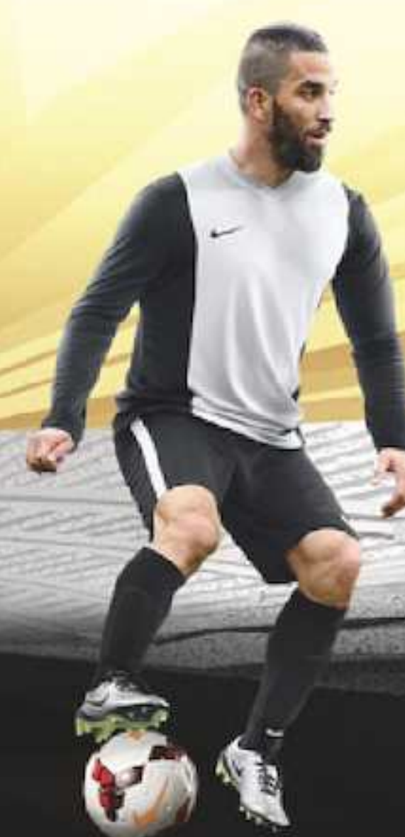
PARK DERBY JERSEY