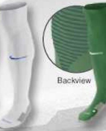
302 Pine Green/ Dark Cypress/ (White)