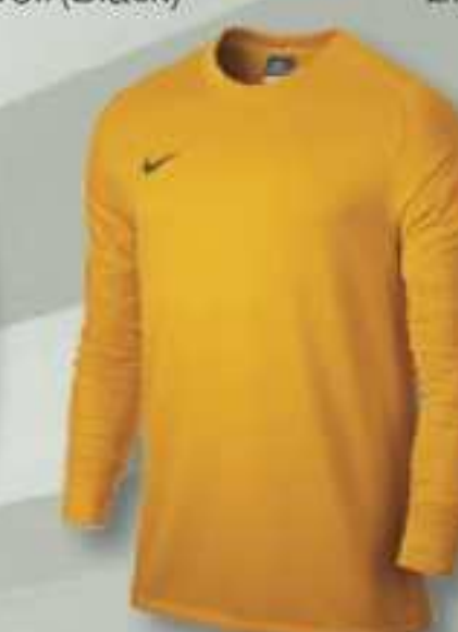
739 University Gold/(Black)