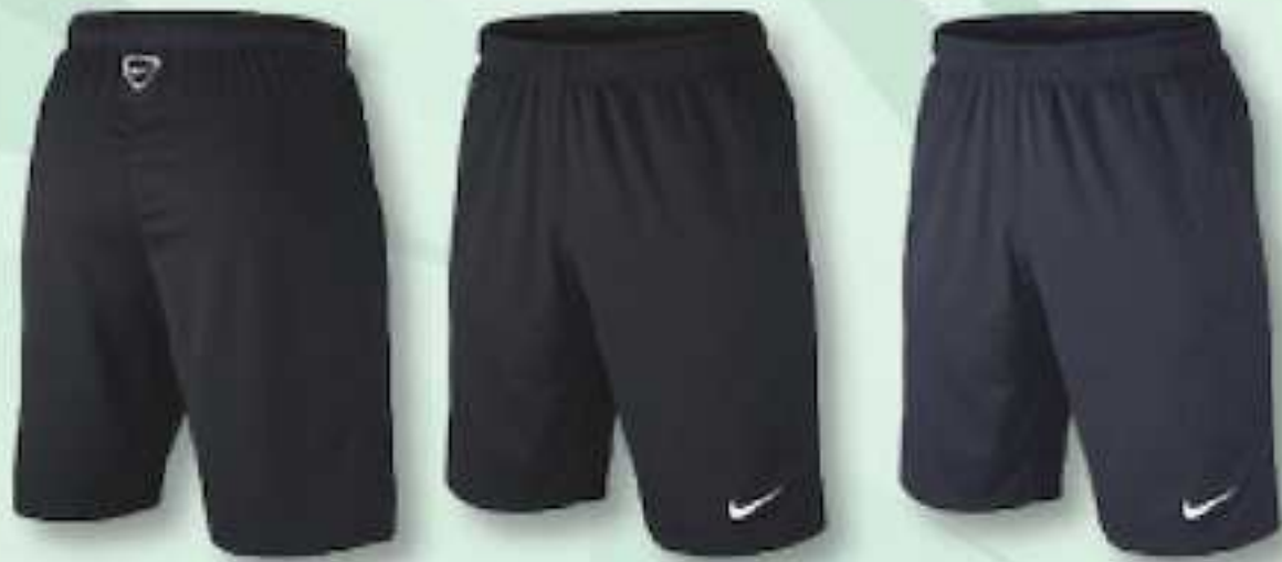
010 Backview 010 Black/(White) 451 Obsidian/(White)