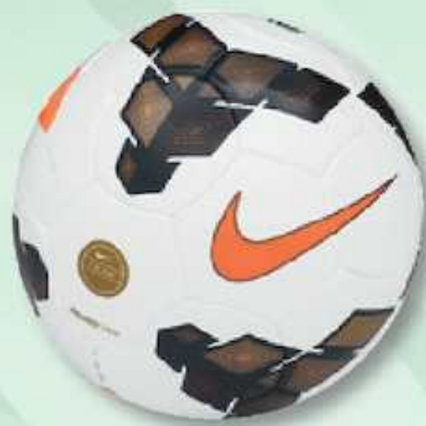
177 White/Gold/ (Total Orange)

Life-cycle: 01 April 2015 - 30 September 2017