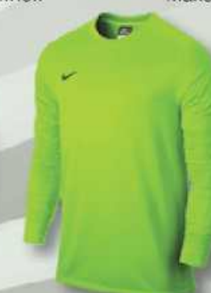
303 Electric Green/(Black)