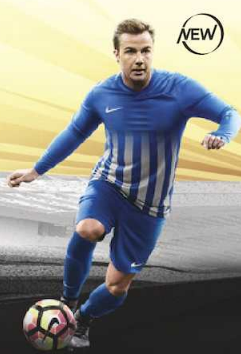
STRIPED DIVISION JERSEY