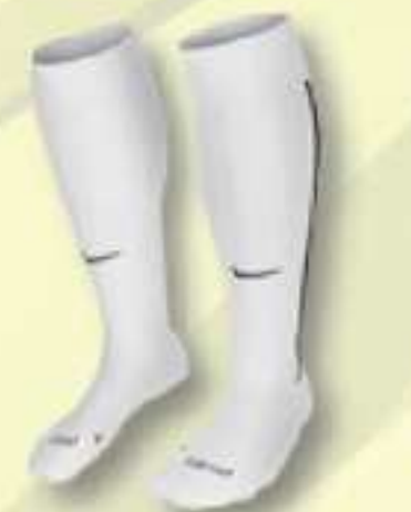
156 Football White/Black/ (Black)