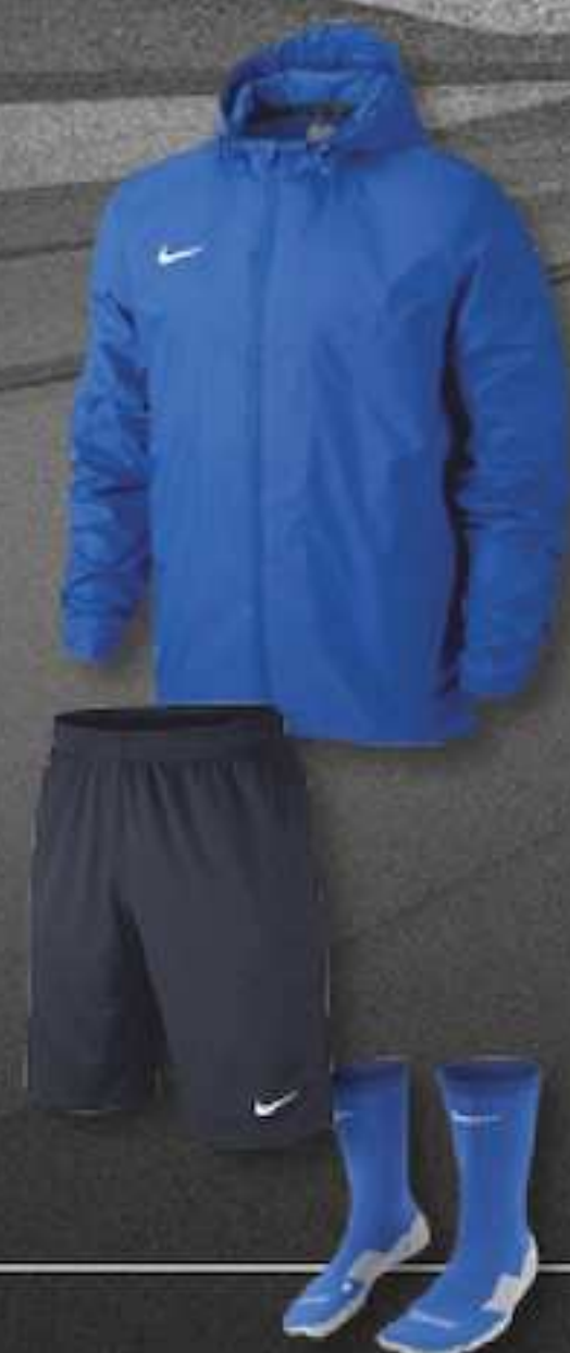
TEAM MATCHFIT CORE CREW SOCK p.57