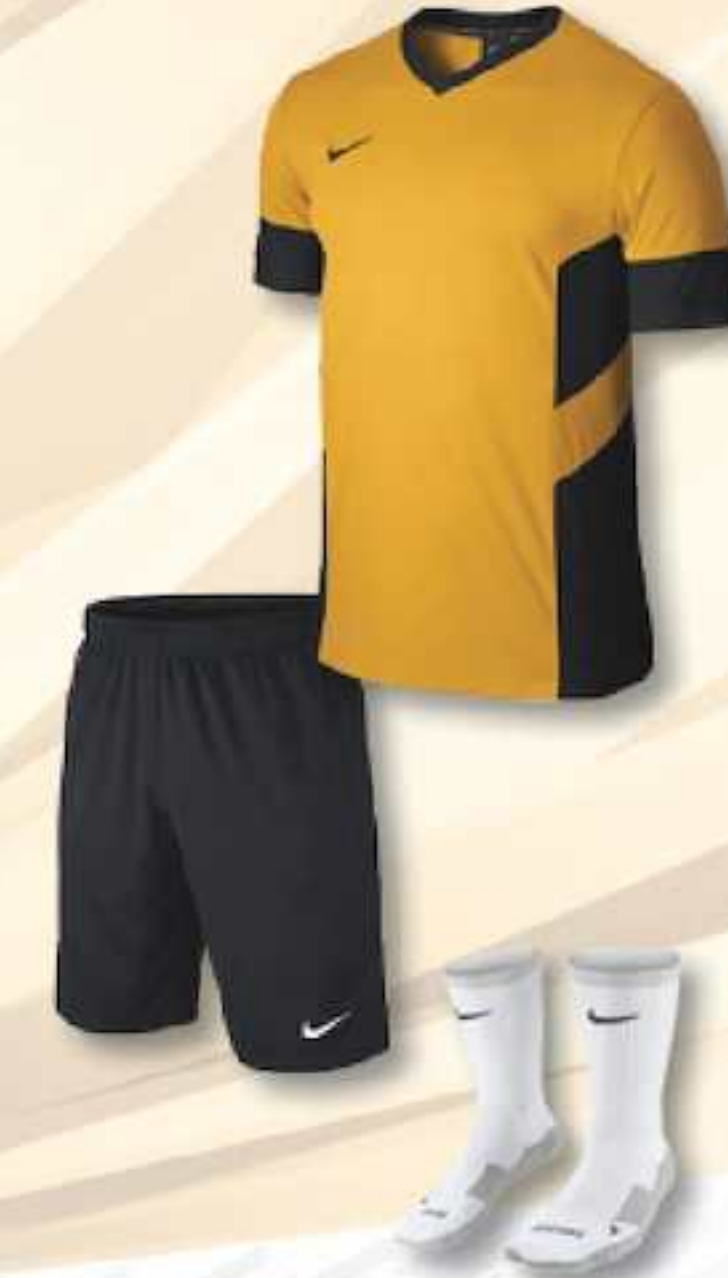
TRAINING TOP p.50