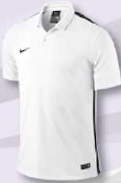
156 Football White/Black/ (Black)