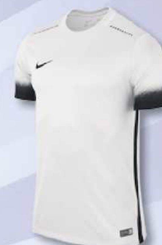
100 White/Black/ (Black)