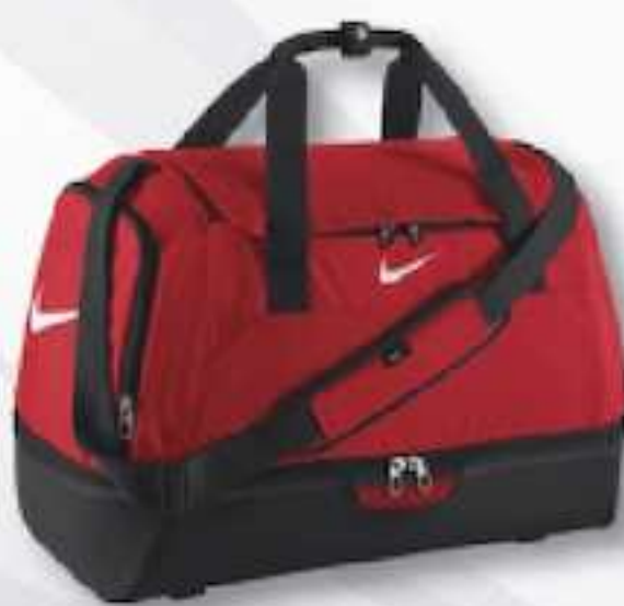
657 University Red/Black/(White)