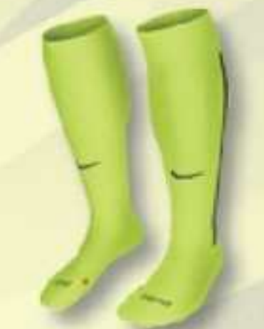
715 Volt/Black/ (Black)

822892 XS: Eur 30-34 S: Eur 34-38 M: Eur 38-42 L: Eur 42-46 XL: Eur 46-50 RRP € 15 XS: UK 12-2 S: UK 2-5 M: UK 5.5-7.5 L: UK 8-11 XL: UK 11-14.5