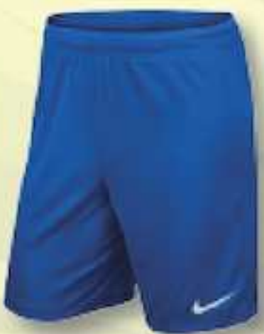
463 Royal Blue/ (White)