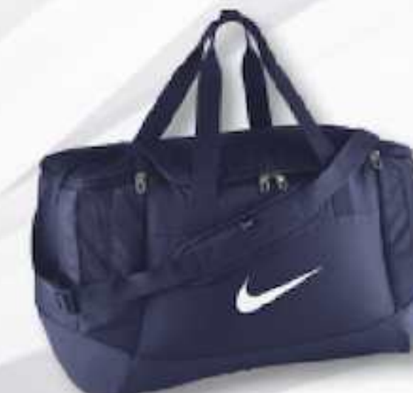
410 Midnight Navy/Midnight Navy/(White)