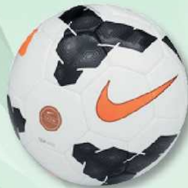
107 White/Black/ (Total Orange)

Life-cycle: 01 April 2015 - 30 September 2017