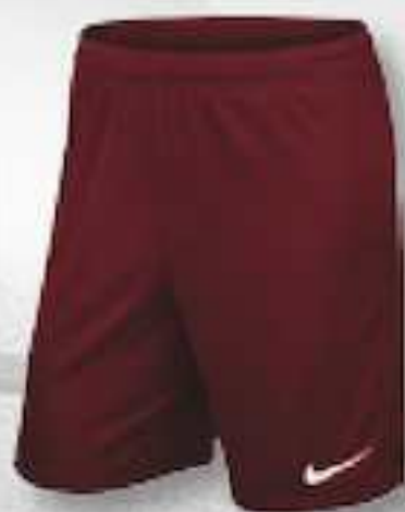
677 Team Red/ (White)