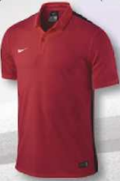
657 University Red/Black/ (Football White)