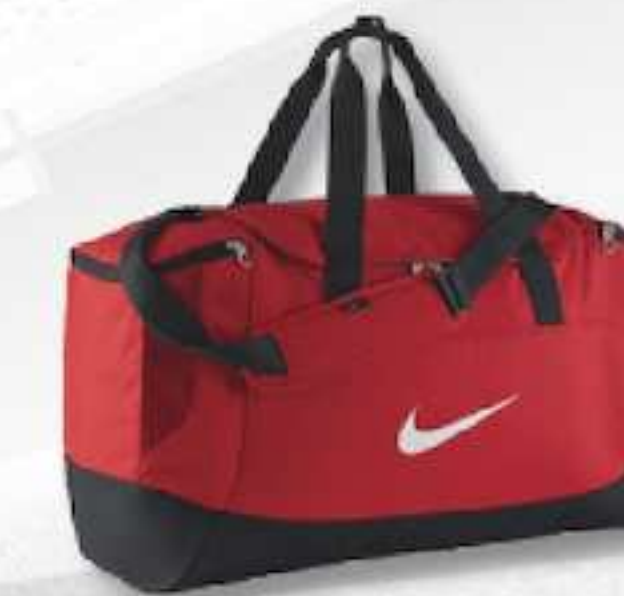
658 University Red/Black/(White)