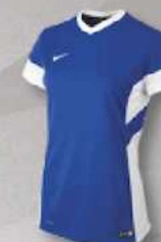
463 Royal Blue/White/ (White)