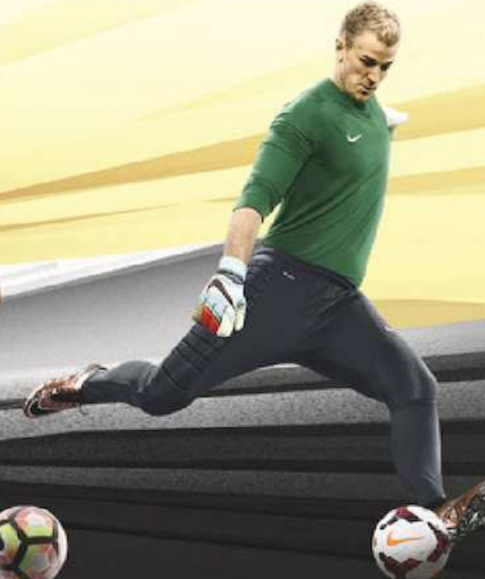
PARK GOALIE II JERSEY