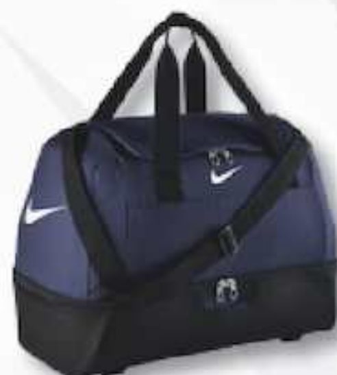
410 Midnight Navy/Black/(White)