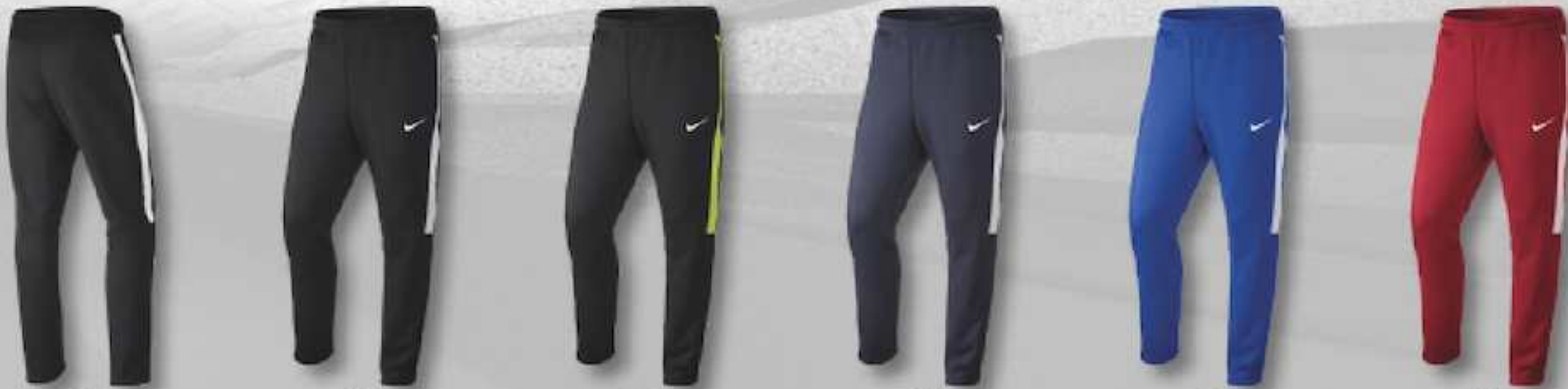
010 Backview 010 Black/Football White/(Football White) 011 Black/Volt/(Football White) 451 Obsidian/Football White/(Football White) 463 Royal Blue/Football White/(Football White) 657 University Red/Football White/(Football White)