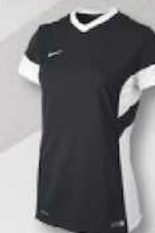
010 Black/White/ (White)