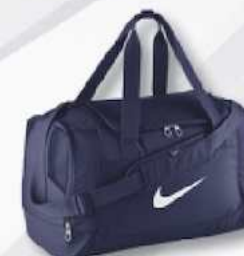
410 Midnight Navy/Midnight Navy/(White)