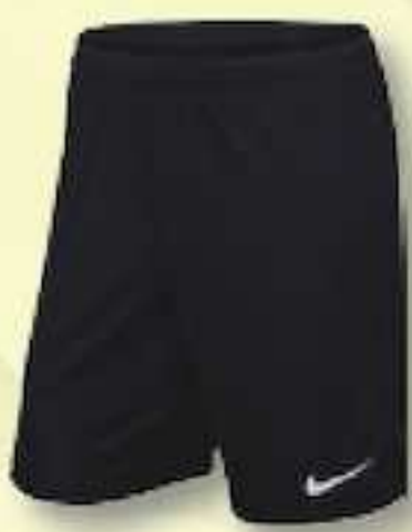
010 Black/ (White)