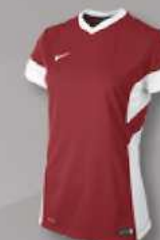
657 University Red/ White/(White)