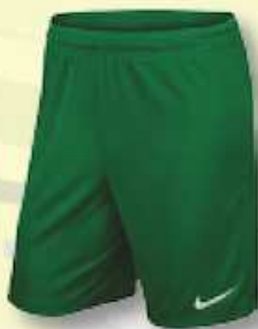
302 Pine Green/ (White)