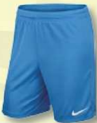
412 University Blue/ (White)