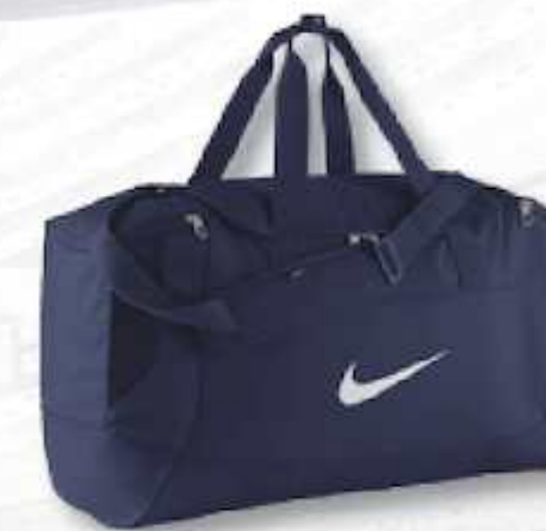
410 Midnight Navy/Midnight Navy/(White)