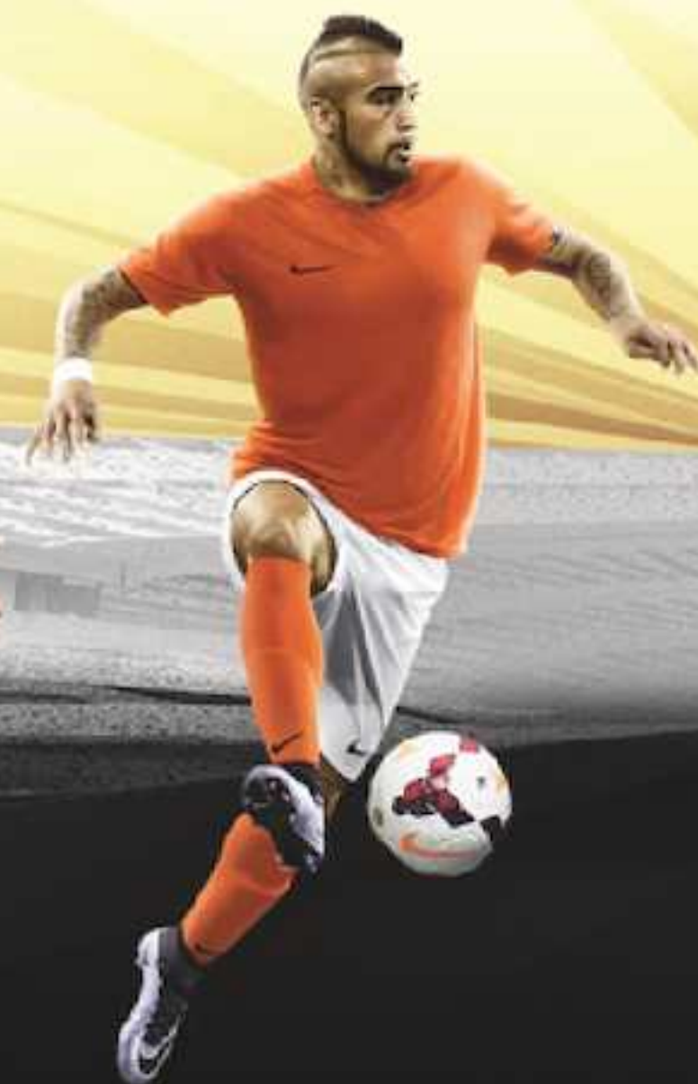
ENERGY III JERSEY