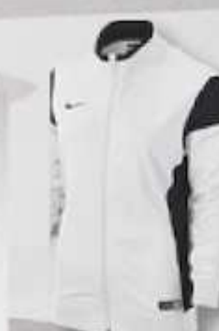
100 White/Black/ (Black)