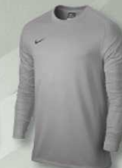
001 Matte Silver/(Black)