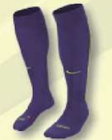
547 Court Purple/Volt/ (Volt)