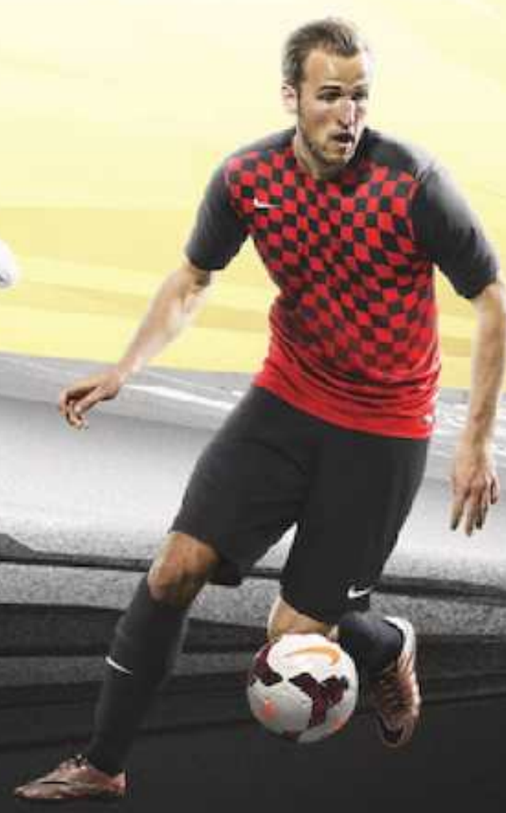
PRECISION III JERSEY