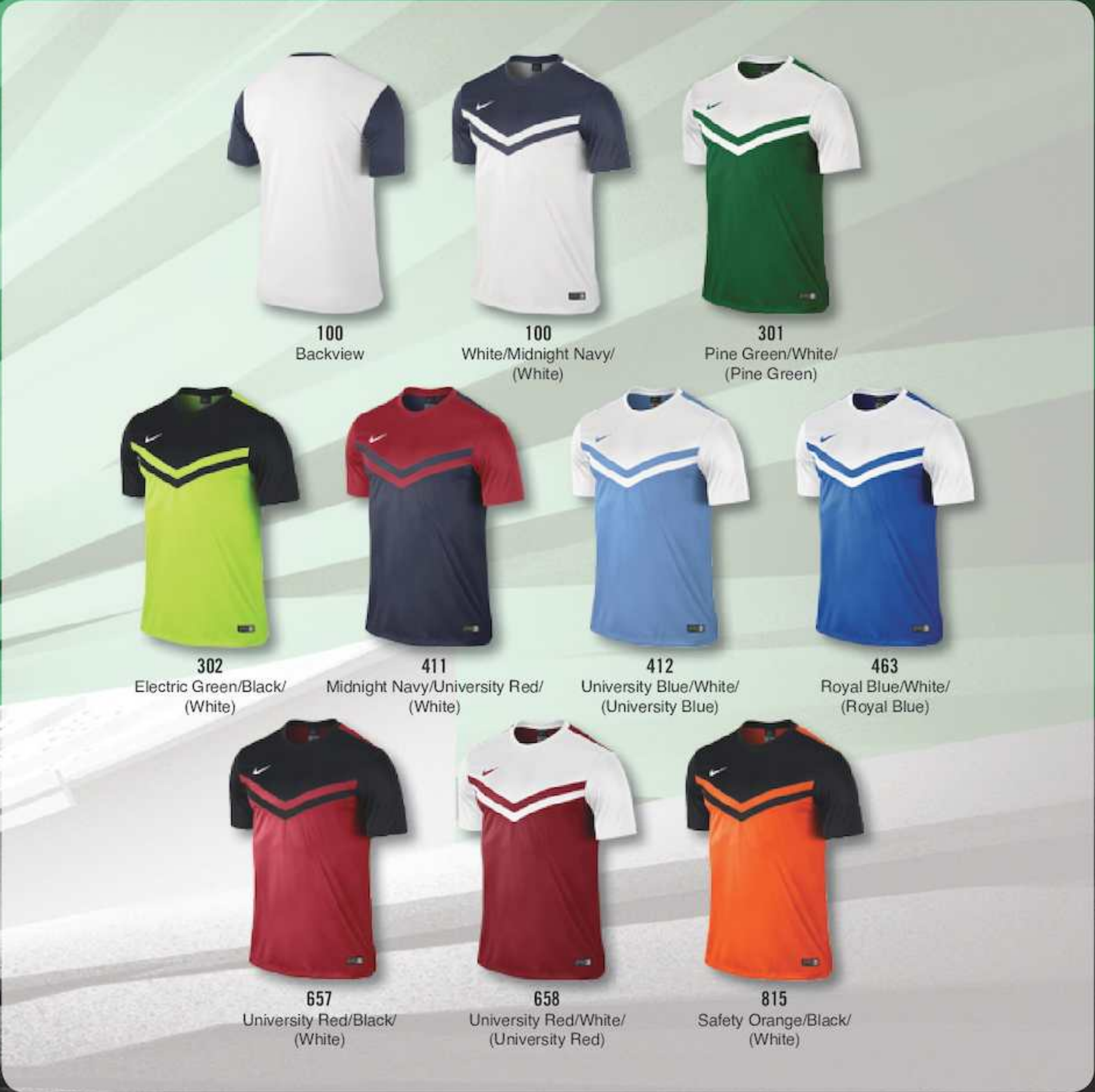
VICTORY II JERSEY