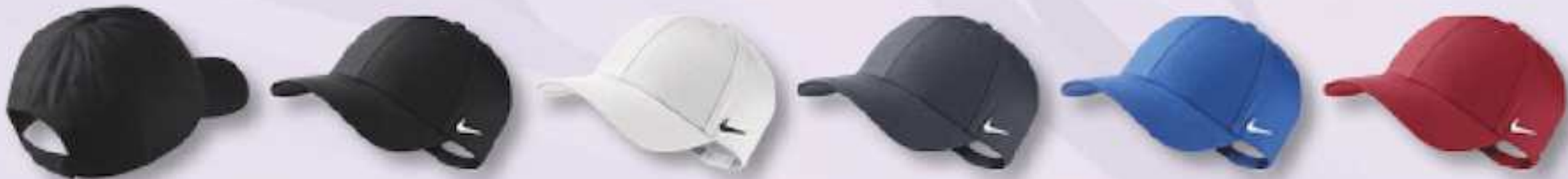
010 Backview 010 Black/Black/(Football White) 156 Football White/Football White/(Black) 451 Obsidian/Obsidian/(Football White) 463 Royal Blue/Royal Blue/(Football White) 657 University Red/University Red/(Football White)

Covered before of after a game. • Snapback design. • Swoosh on the side. • One size fits all. • Fabric: 100% cotton.