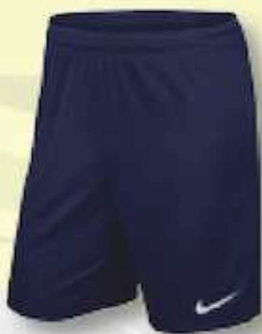
410 Midnight Navy/ (White)