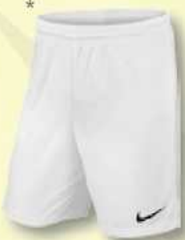
100 White/ (Black)