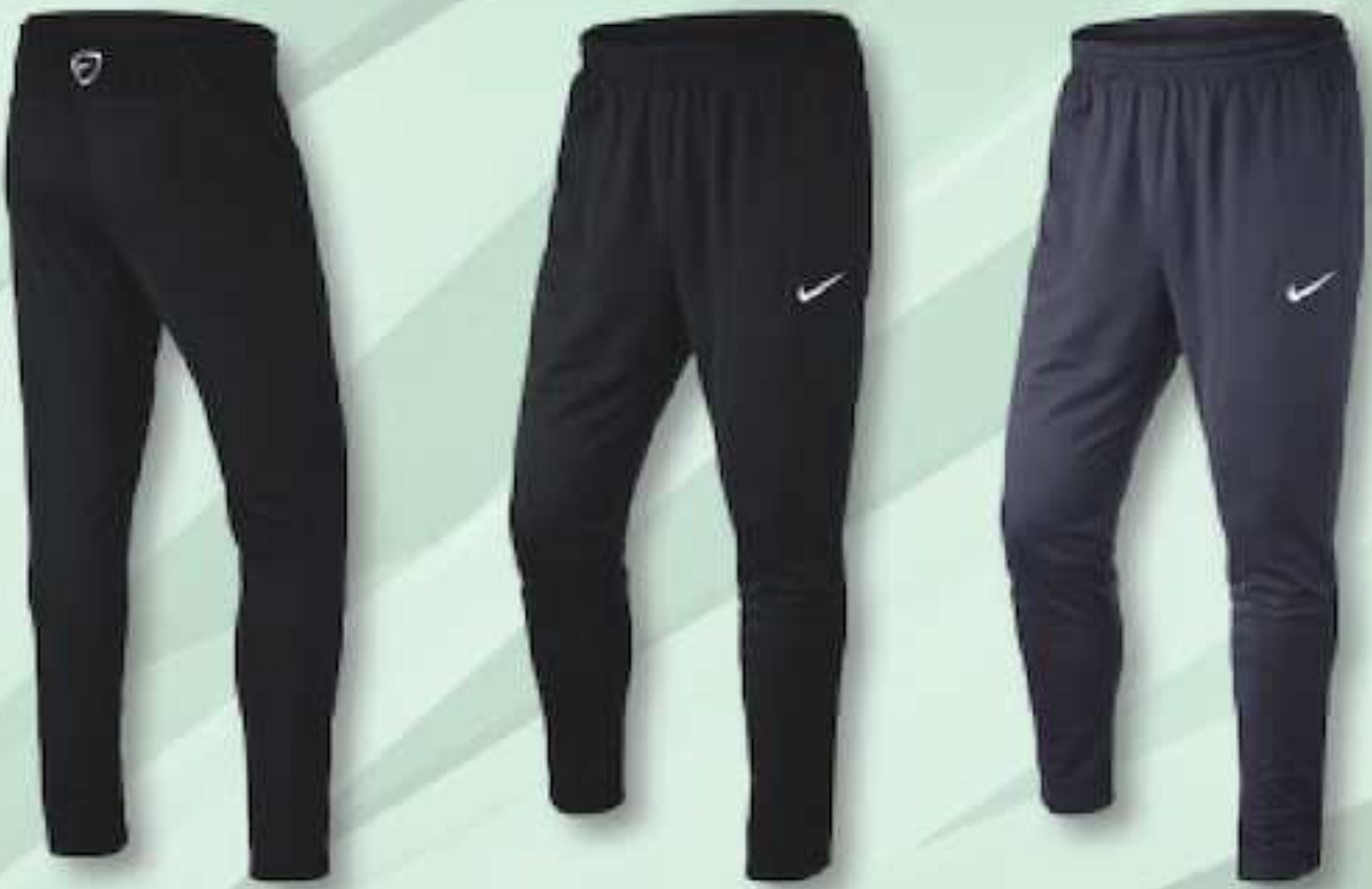
010 Backview 010 Black/(White) 451 Obsidian/(White)