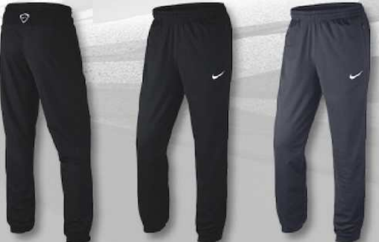
010 Backview 010 Black/(White) 451 Obsidian/(White)