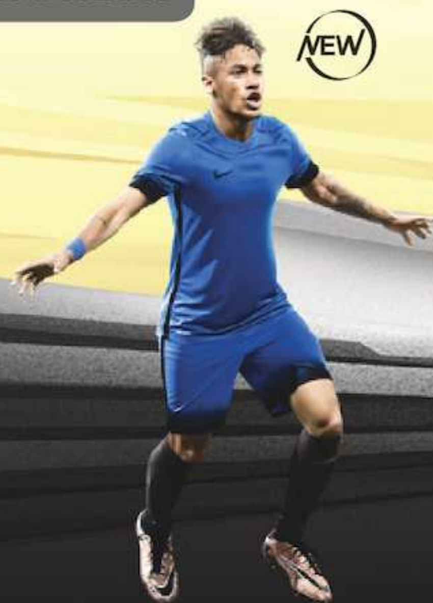
LASER III JERSEY