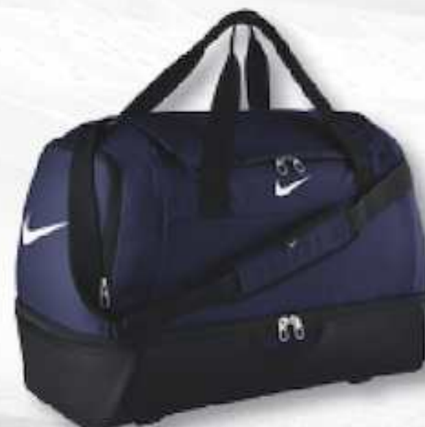
410 Midnight Navy/Black/(White)