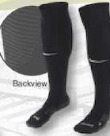
010 Black/ Anthracite/ (White)