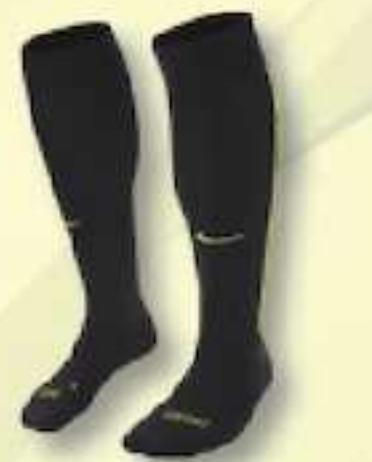
011 Black/Volt/ (Volt)