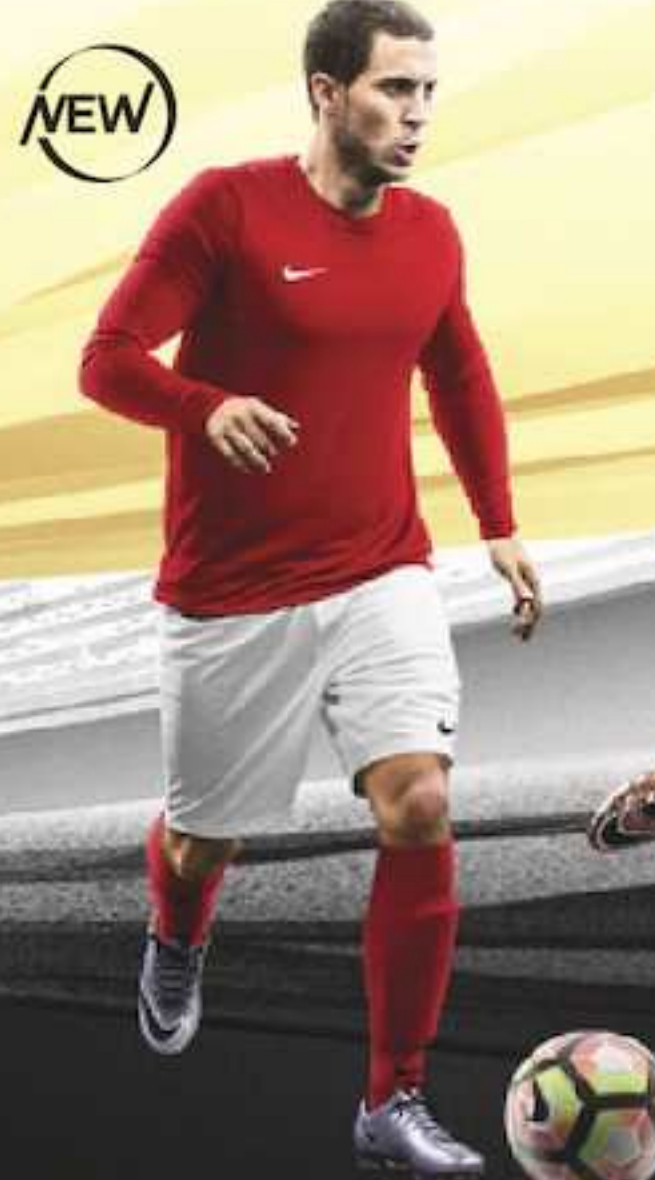
PARK VI JERSEY