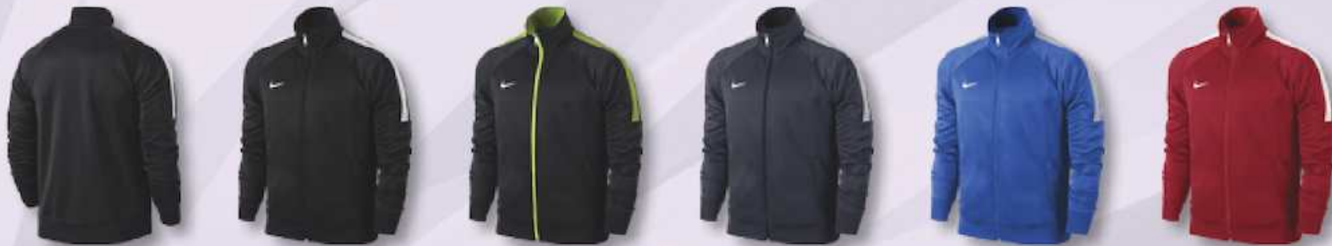
010 Backview 010 Black/Football White/(Football White) 011 Black/Volt/(Football White) 451 Obsidian/Football White/(Football White) 463 Royal Blue/Football White/(Football White) 657 University Red/Football White/(Football White)