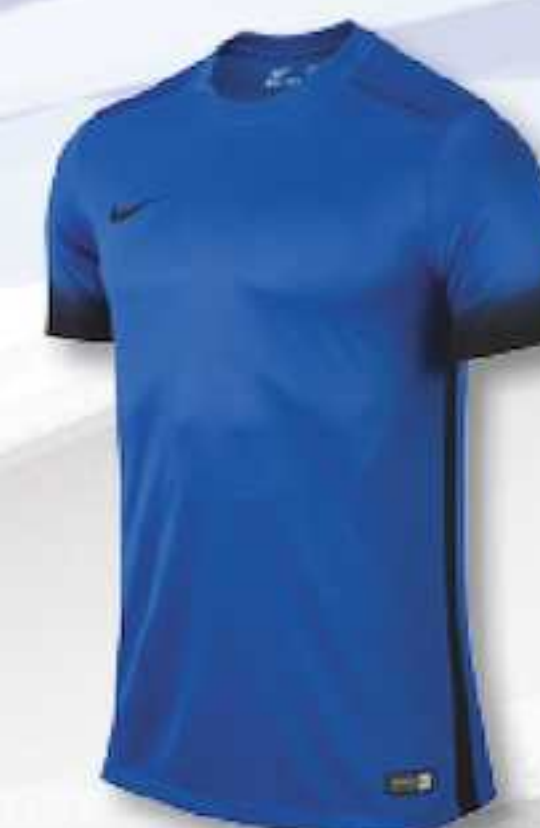
463 Royal Blue/Black/ (Black)