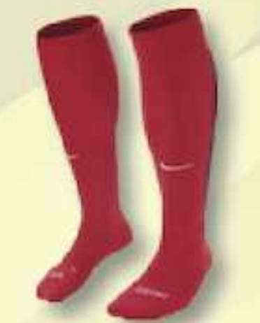
657 University Red/Black/ (Football White)