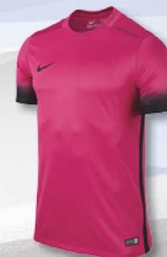
616 Vivid Pink/Black/ (Black)