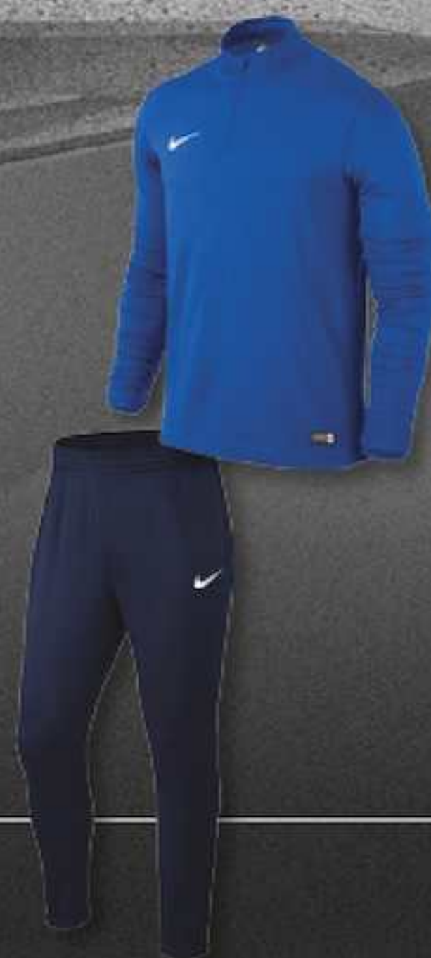
IGNITE MIDLAYER p.46