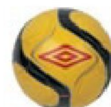
Yellow/Black/ Red/Silver - CAU