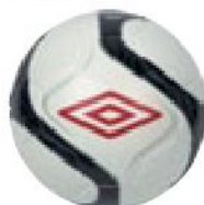
White/Black/ Red/Silver - J47