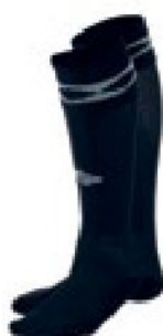
1. Black/White 090

S (10-2) Junior M (3-6) Junior L (7-12) Adult