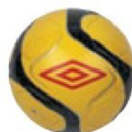
Yellow/Black/ Red/Silver - CAU