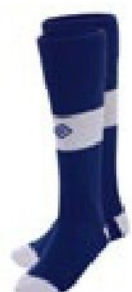
Dary Navy/White N84