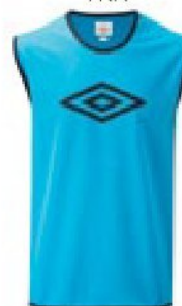
Brilliant Blue/Black 5DG