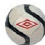
White/Black/ Red/Silver - J47